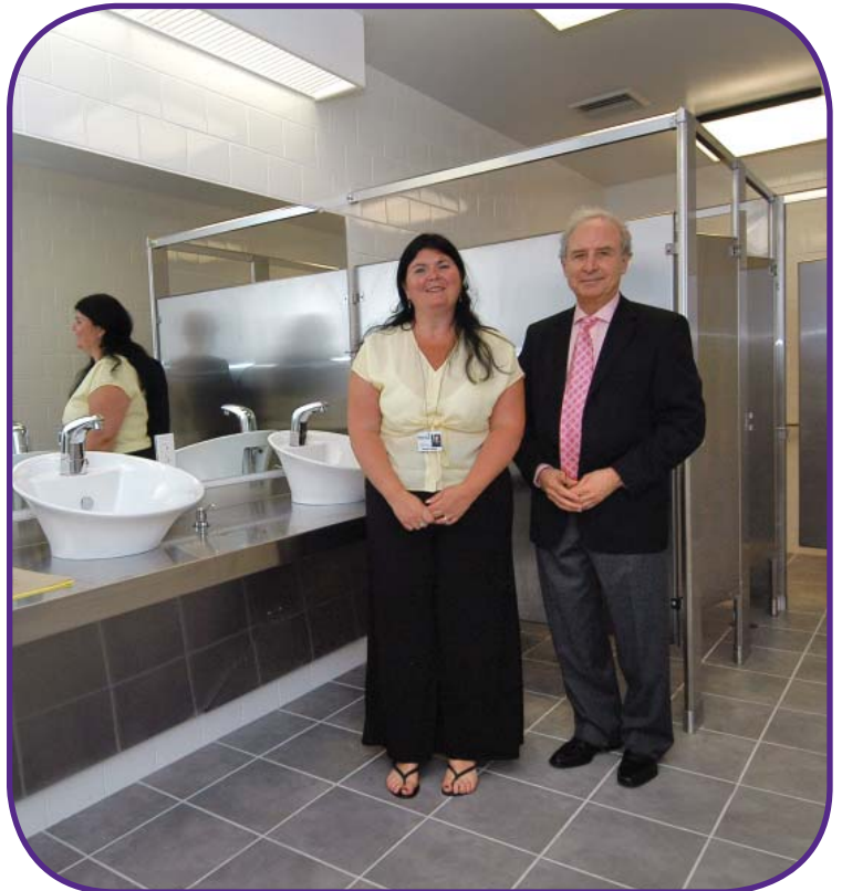
The photo above shows a recently remodeled staff restroom.