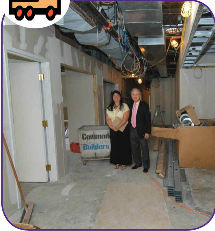
The upper level of our 240 building is still under construction.