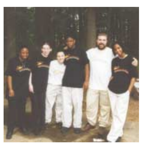
The lunch crew gathers for a picture at one of our weekly barbecues.