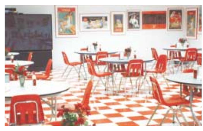
The new multi-purpose room serves as a student lunchroom as well as a location for field day activities and dances. Coca-cola prints surround the room and the tables have Coke-theme accoutrements.