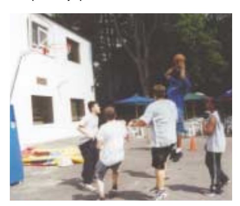
Some students play a game of basketball as part of their physical education class.