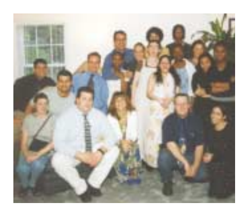
Staff and students at a recent open house for neighbors in Stoughton.